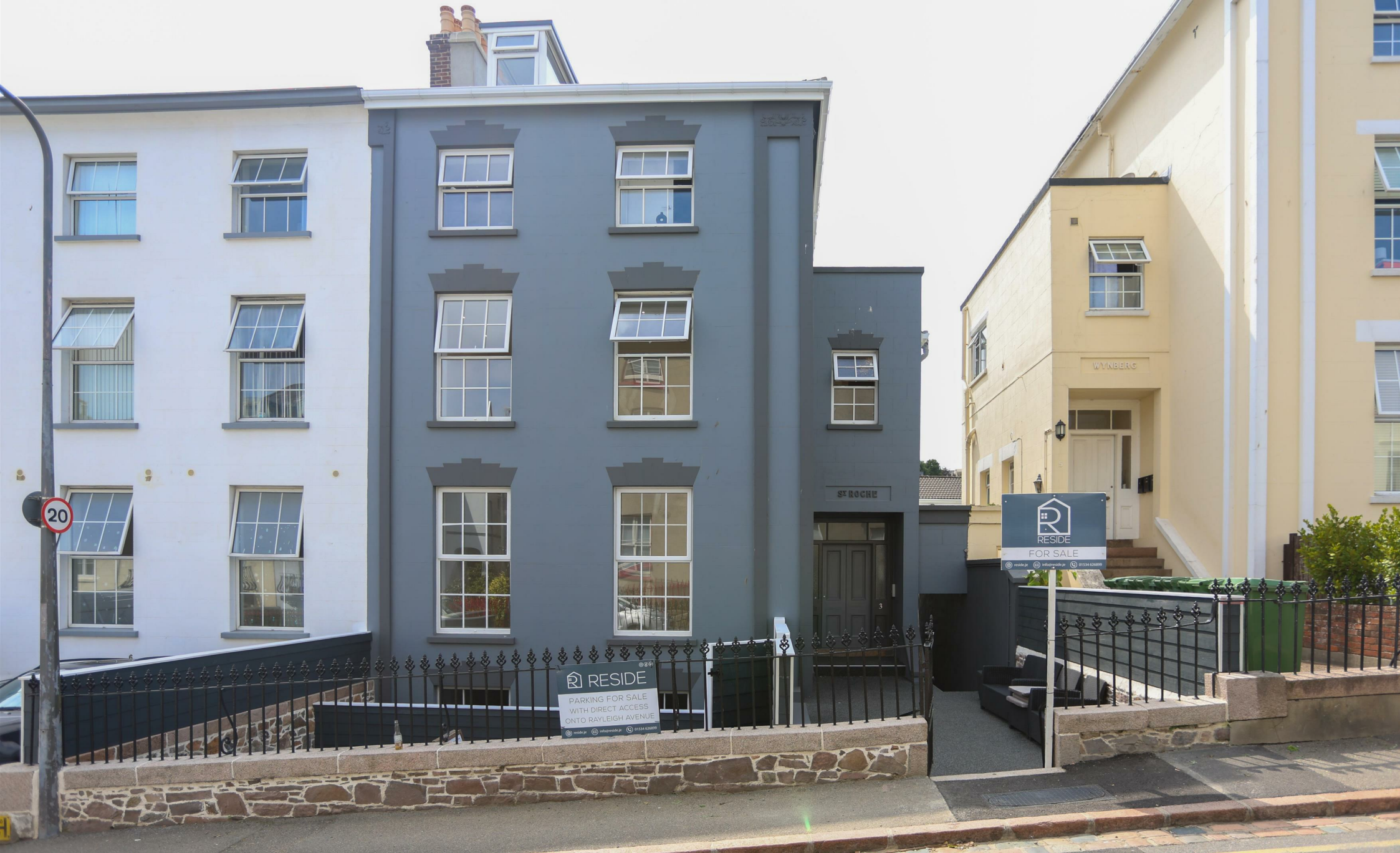
3, St Roche Apartments Raleigh Avenue, St Helier, Jersey, JE2 3ZG £429,000